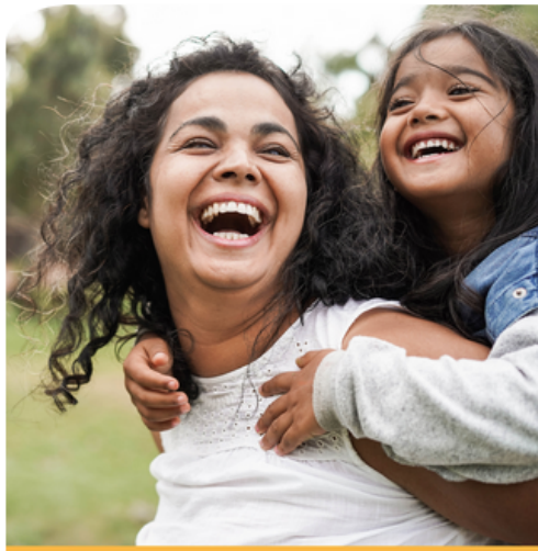
WORKING FAMILIES TAX CREDIT